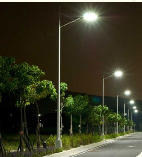
Electrification and street light