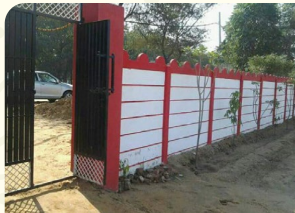
Individual boundary wall with gate

So choose the best way of living a fulfilling life.