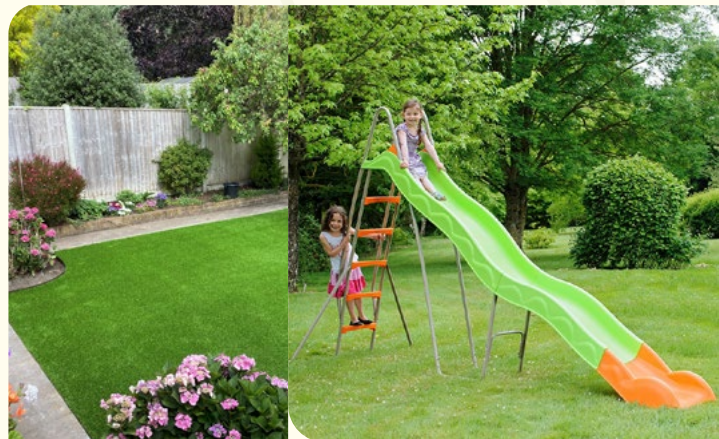
Children play area with Landscaped gardens