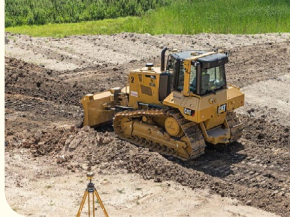
Plots levelled upto road