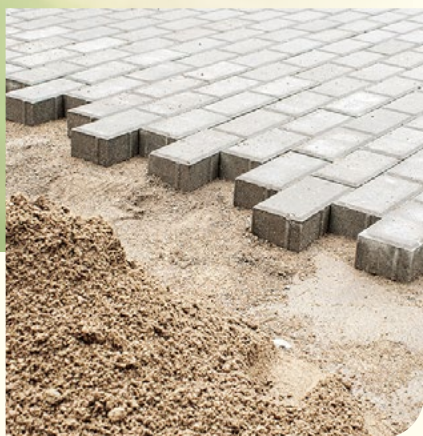
30 feet internal paved road with Drainage system