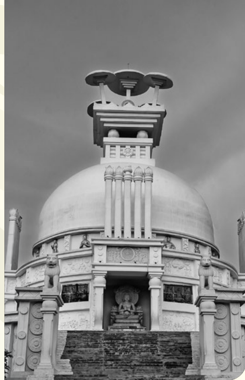
Neighbour to one of the world renowned tourist attraction ; Dhauli.