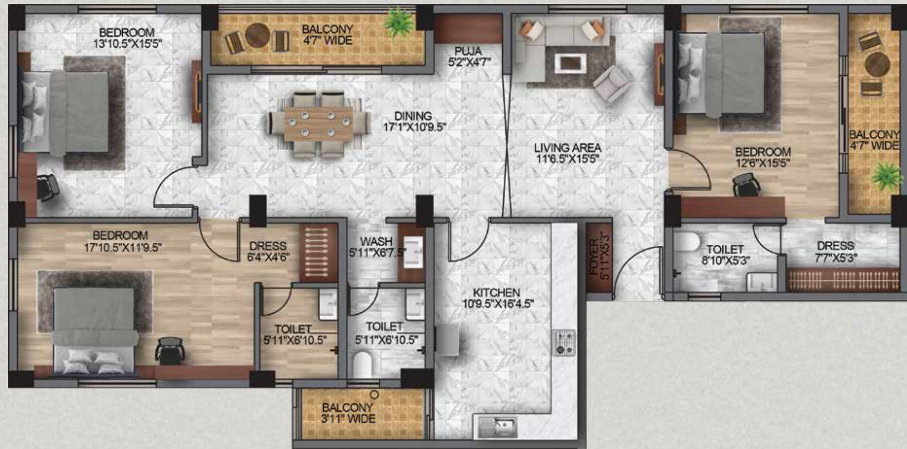
Plan - C