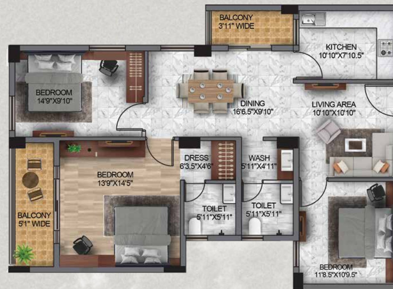
Plan - B

Carpet Area - 1015.52 Sqft. Built Up Area - 1241.05 Sqft. Super Built Up Area - 1898.81 Sqft.