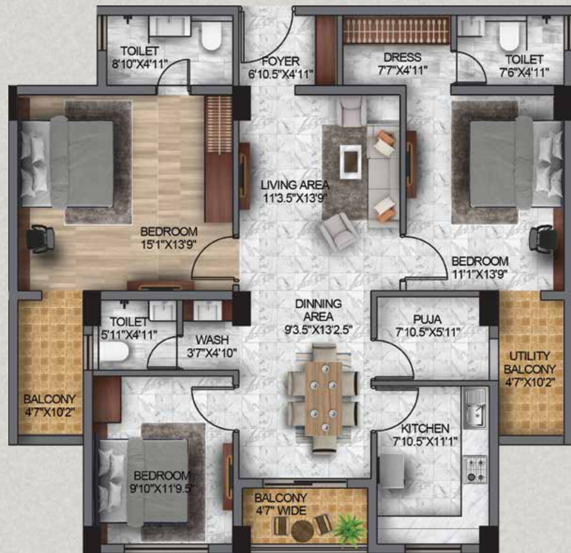
Plan - A

Carpet Area - 1171.76 Sqft. Built Up Area - 1402.24 Sqft. Super Built Up Area - 2145.43 Sqft.