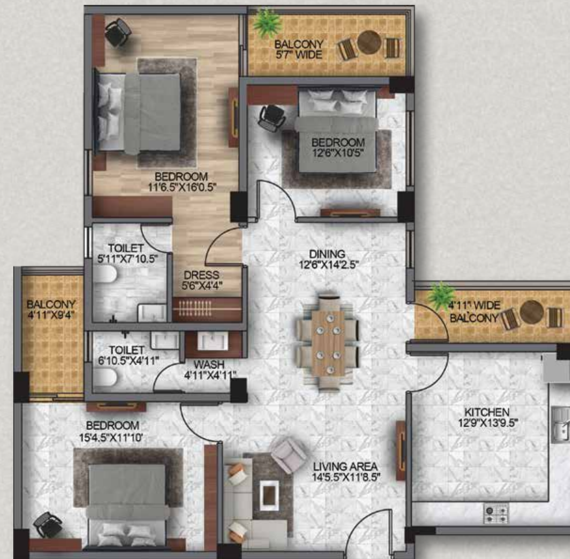
Plan - D