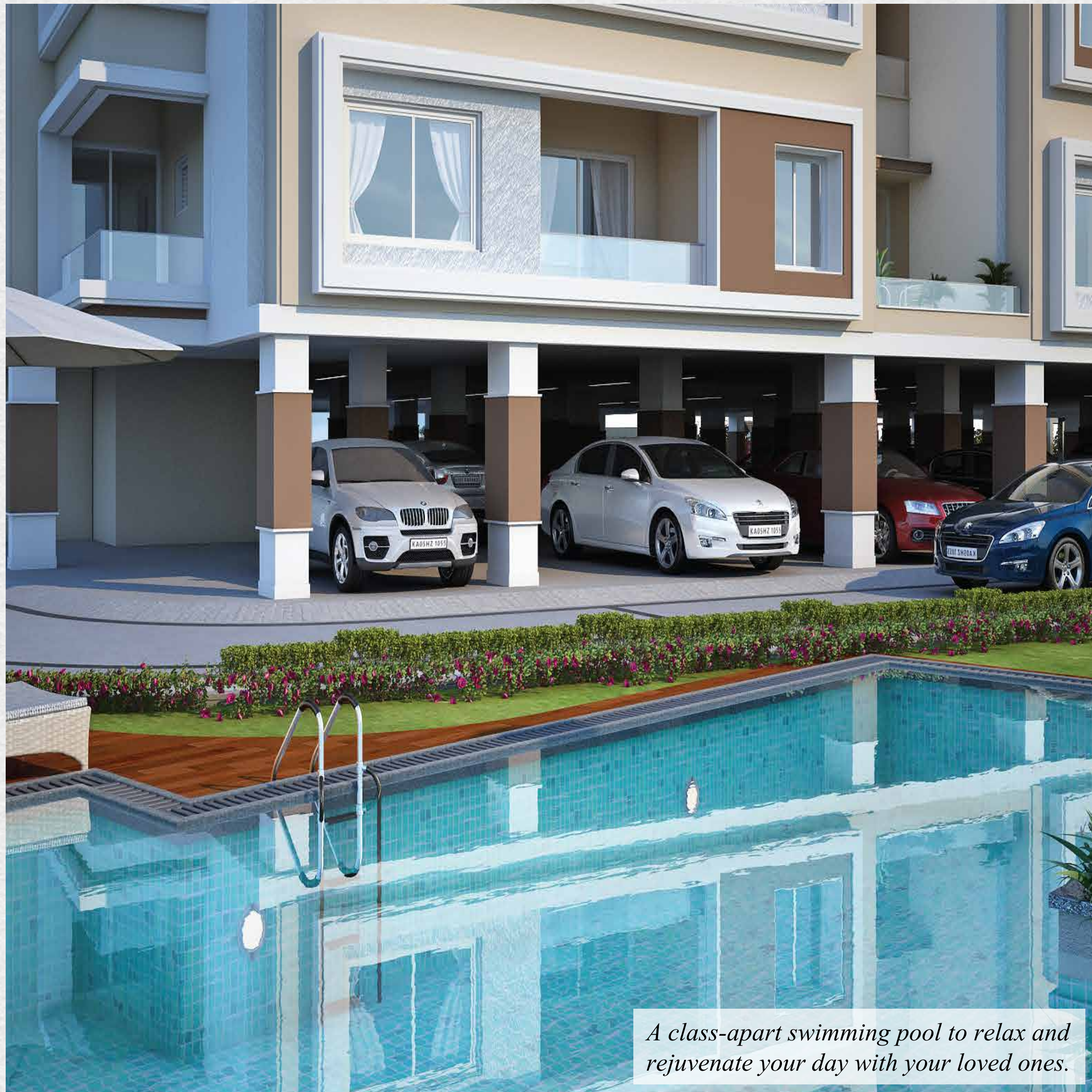
A class-apart swimming pool to relax and rejuvenate your day with your loved ones.